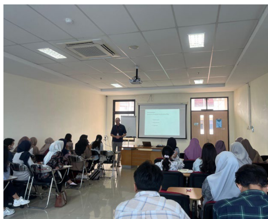
Figure 5. Evidence of the implementation of the Pharmacotherapy I lecture by Dr. Lutz Vogel

By increasing the number of foreign lecturers, the Faculty of Pharmacy is committed to furthering its efforts to improve the quality of education. Furthermore, the faculty has arranged the arrival of other foreign lecturers through the DAAD Gastdozentprogramm grant in October 2024 and SES funding in August 2024.